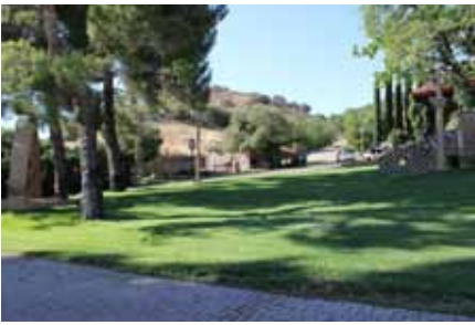
Hacienda Lane Ranch before the Setup