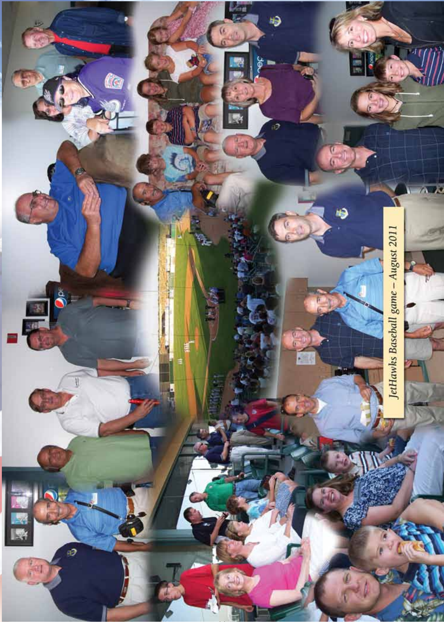
JetHawks Baseball game – August 2011