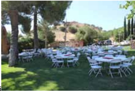
The Setup is Complete