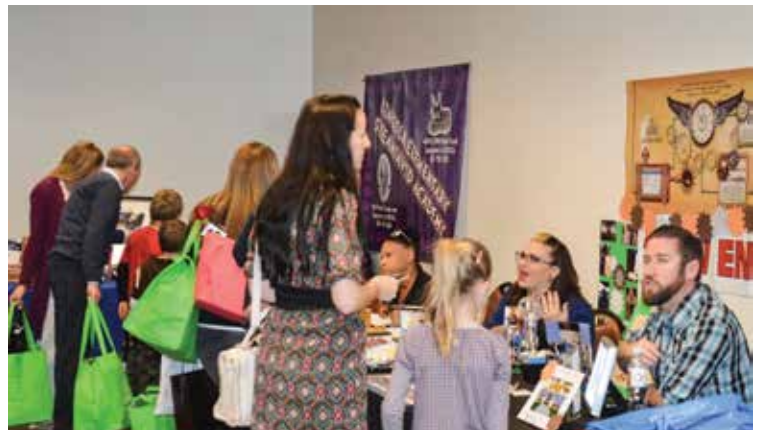
Families visit some of the schools and organizations at the Welcome to the AV event in Palmdale.

Whilst the children were busy doing what they do best; causing chaos, making paper aeroplanes and generally having fun with the Museum of Art History staff downstairs, the adults got a chance to browse the stalls and find out about local businesses, opportunities and attractions. Vendors included health providers, schools, colleges, Edwards Air Force Base support - the list was pretty extensive. It was really useful to find out what opportunities there are for all the new families and how perhaps they could volunteer in the hospital or how they could apply for a college course. Even finding out why we foreigners are not able to donate blood was useful (albeit a little frustrating). Finally, how can we forget the goody bags? Weighed down by leaflets, pens, sweets, T shirts, gift cards and other paraphernalia, our guests left happy, smiling and better informed about the area that they have moved to. The whole evening was a great success and appreciated by all.