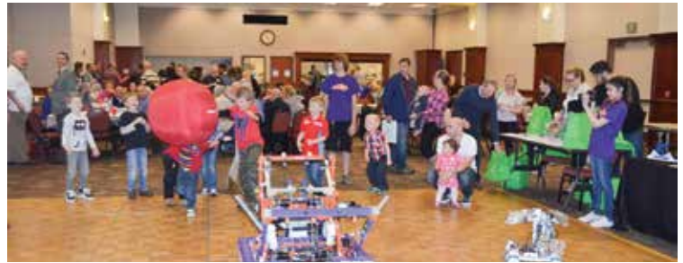
Lancaster High School's Eagles Robotics Team's Cortex interacts with the kids at the 2nd Annual Welcome to the AV event for our International Partners and families.